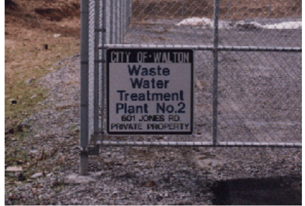
Figure 2 City of Walton WWTP #2