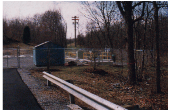
Figure 4 Testing Shed, Flow Monitoring