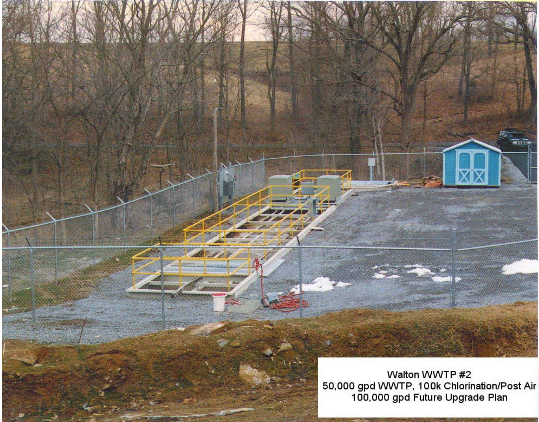
Walton WWTP #2 50,000 gpd WWTP, 100k Chlorination/Post Air 100,000 gpd Future Upgrade Plan