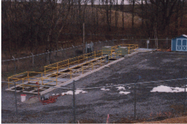
Figure 1 Site Plan Allows 50k Upgrade

50,000 gpd Extended Aeration WWTP, Sludge Digester, 100,000 gpd Detached Chlorine Contact Tank/Post Aeration Site Graded and Planned for future 100,000 gpd design flow