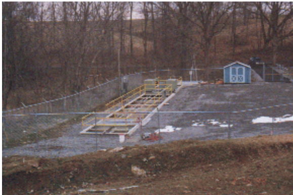
Figure 3 Future 100k gpd Design Flow