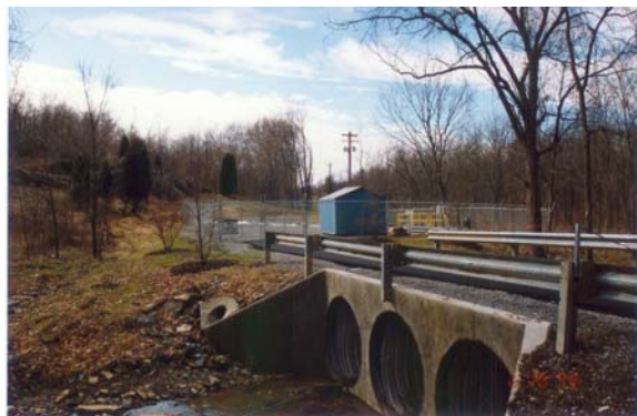
Figure 5 Landscaping