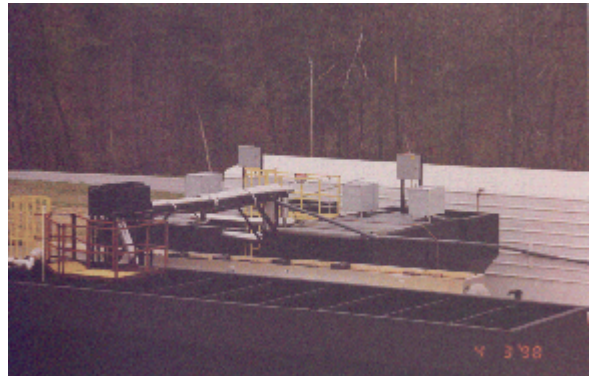
Figure 2) 30,000 Gal. Flow Equalization