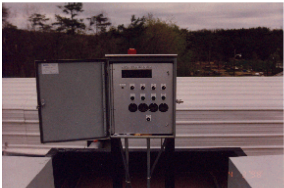
Figure 5) WWTP & F.E. Control