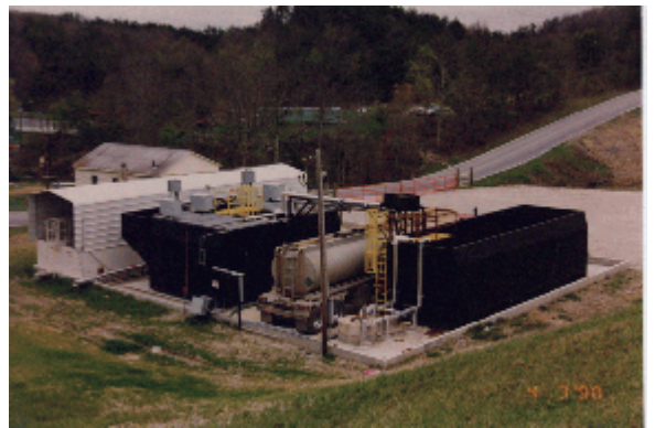
Figure 4) Dual 10,000 gpd WWTP