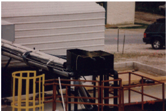
Figure 3) Flow Splitter Box