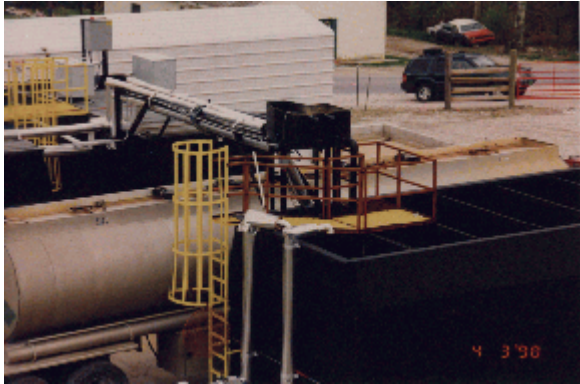
Figure 1) Aerial Discharge and Wasting

Leachate Pre-Treatment Facility, 20,000 gpd Ungradable to 30,000 gpd 30,000 gal Flow Equalization, Dual 10,000 gpd Extended Air WWTP's, 20,000 Holding