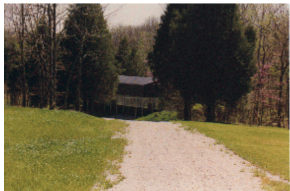
Figure 6 Colored Roof Minimizes Impact