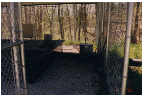
Figure 5 Aerial Inlet