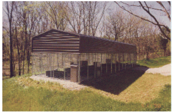
Figure 2 Protection From Leaves & Debris