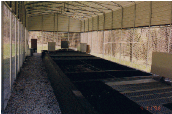
Figure 3 Interior View, Flow Equalization