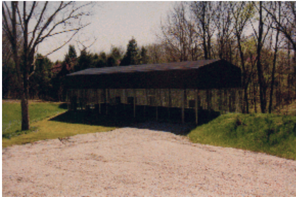
Figure 1 Exterior View of WWTP Shelter