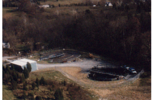
Figure 2 Addition 2 – Circular Clarifier