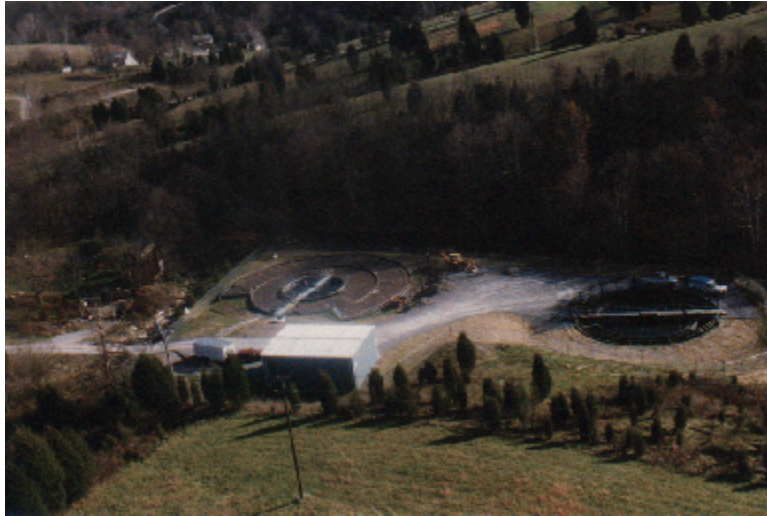
Figure 3 Center View