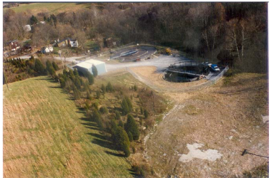
Alexandria Treatment Plant, Campbell Co., Ky. Sanitation District #1, Ft. Mitchell, Ky. 1 st Stage – Partial Ring Addition 2 nd Stage – Circular Clarifier, S.H.T., Chlorination