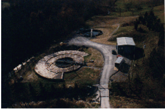
Figure 1 Addition 1 – Aeration Expansion

2 nd Upgrade: Circular Clarifier/Sludge Digester/Disinfection