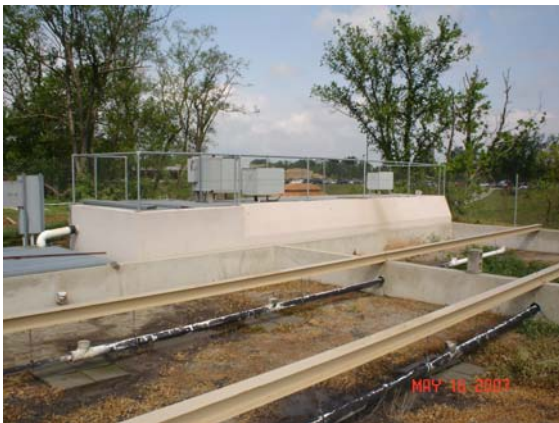
Fig. 3) Looking over Sand Filter at WWTP