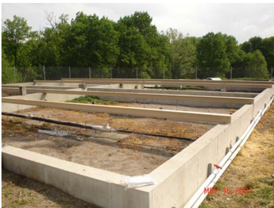
Fig. 5) Slow Sand Filter