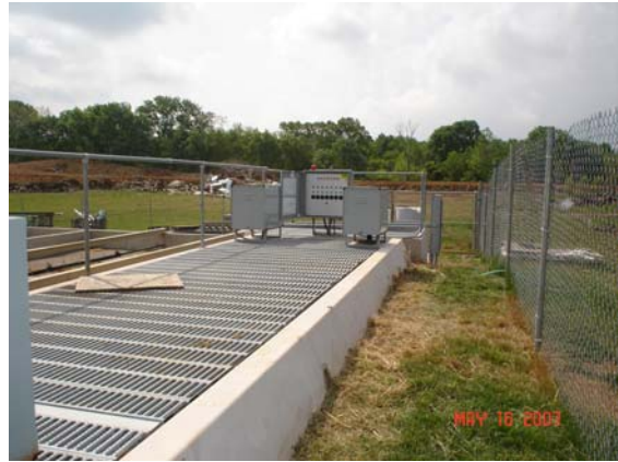
Fig. 2) Looking towards Clarifier end of WWTP