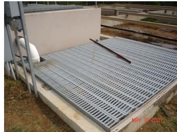
Fig. 4) Slow Sand Filter Dosing Tank