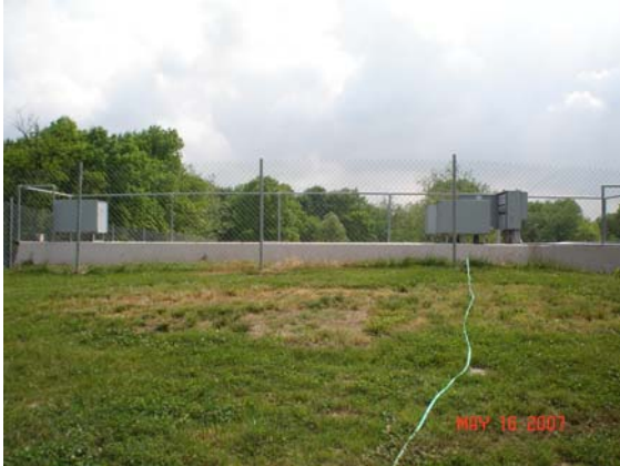
Fig. 1) WWTP

Flow Equalization, Sludge Digester, Site built Slow Sand Filter with Dosing Tank Discharges from Slow Sand Filter to Traditional Leach Field through second Dosing Tank